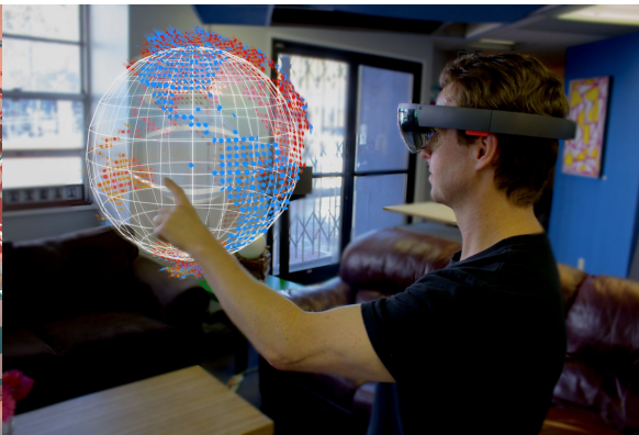
Global Data Visualization VR / AR