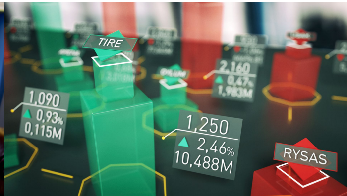
MARKET CITY AR / VR