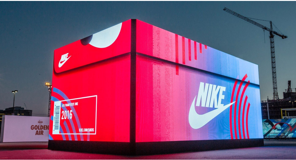
NIKE ACTIVATION SF