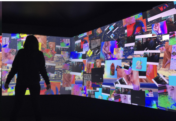
DIGITAL DESIGN DAYS + OFFF Milan