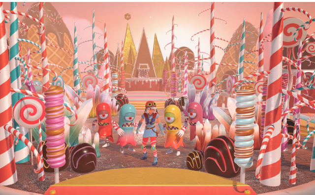
CANDY LAND VR